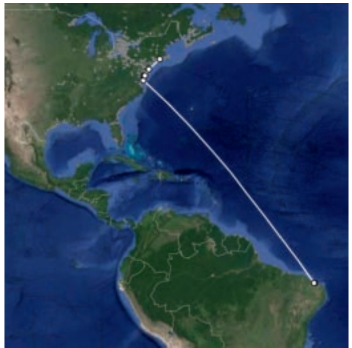
This map depicts the migration of one Semi-palmated sandpiper (ID# 27763) from Brazil to the Virginia Coastal Reserve to DWL's Great Cypress Swamp to the Jersey Shore and beyond! ( https://motus.org/data/track?tagDeploymentId=27763 )