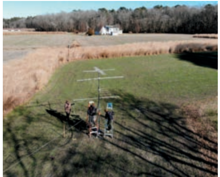
Data collected from this Motus tower at DWL's Roman Fisher Farm show migratory birds utilizing habitat in the Great Cypress Swamp as well as Belize and northern South America.

Accessibility is one of the main goals of the Motus Program. Motus.org is a treasure trove of information. Clicking on a tower brings up the tag detections. From the tags you can find the project name, the date and location of deployment, and, by clicking on the map option, you can see the bird's route, flight speed, and stopover time. The ultimate in bird reality show!