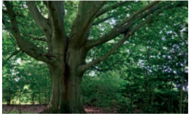
This large American beech tree located at the Fortner Farm is characteristic of the old growth there.

DWL, and other conservation partners, identified this property long ago as a high priority for protection, securing the agricultural and pastoral heritage in the area, safeguarding critical wildlife habitat for waterfowl and migratory birds, stabilizing old growth forest, and enhancing water quality. We are grateful to members of the Fortner Family, for their stewardship of this beautiful property over the generations, and for their patience as DWL worked with our partners and supporters to raise the funds needed for this acquisition. A hearty thanks to the broad coalition that made this project possible: the invaluable contribution and commitment of New Castle County (which purchased a permanent conservation easement on this land), the transformational leadership of Mt. Cuba Center, Delaware Ornithological Society’s Bird-a-thon for their commitment to habitat protection and their contribution to (another) on-the-ground habitat protection project, Copeland Taylor LLC, DMS Real Estate, and many community members who value the iconic character and wildlife of the Augustine Creek watershed and the State of Delaware.