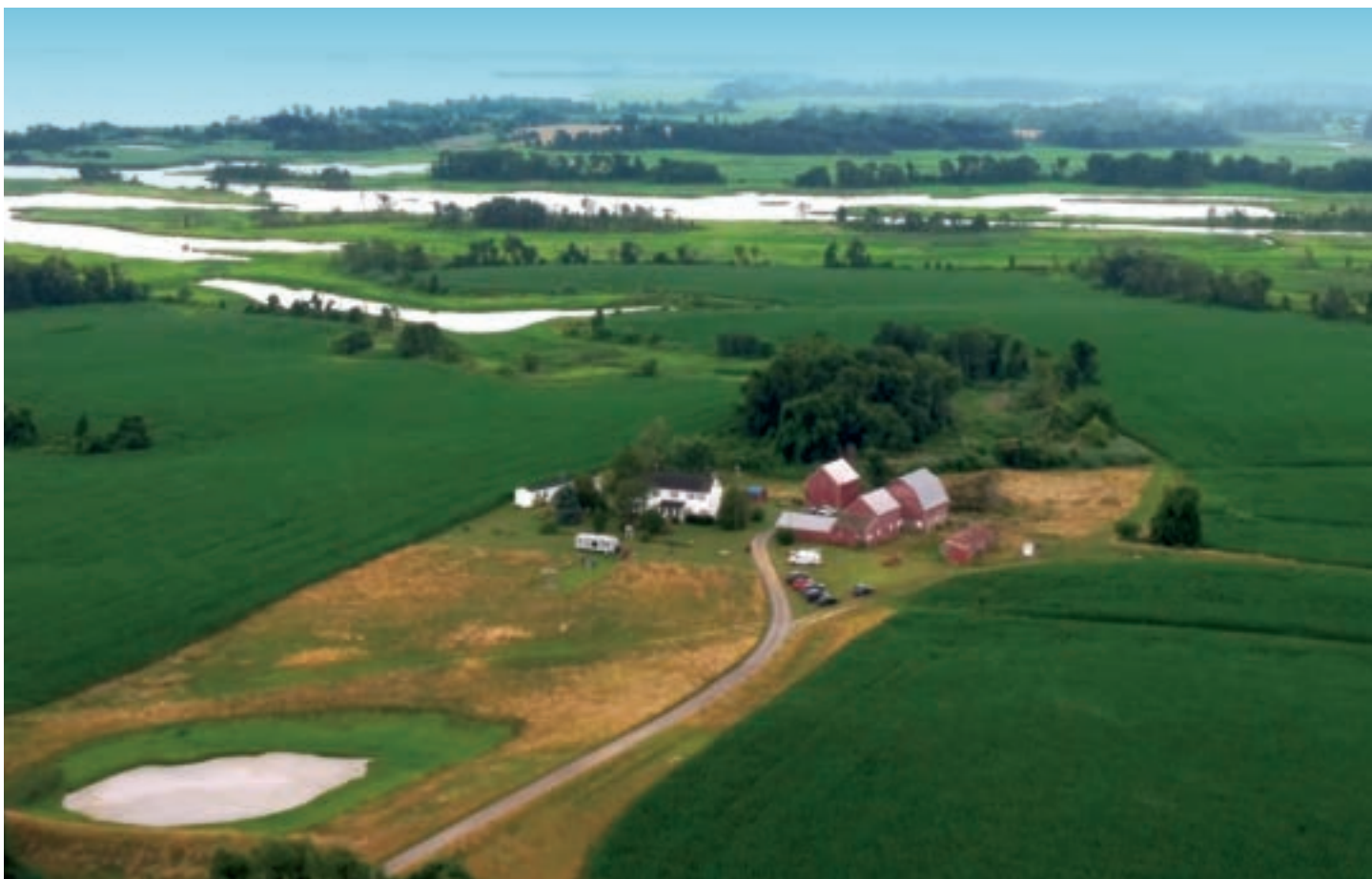
The 225-acre Fortner Farm is part of DWL's Augustine Creek Land Complex with Augustine Creek pictured in the background.

fragmentation, removal of old growth forest, and sea level rise. These threats put in peril natural resources that provide improved water and air quality, stormwater protection, local sources of food production, wildlife habitat, and a variety of coastal woodlands, old growth forest, tidal saltmarshes, and rolling fields and swales that provide valuable habitat for many threatened and rare species. Imperiled species documented in and around the Fortner Farm include, among others, King Rail, American Kestrel, Saltmarsh Sparrow (which is going extinct), Semipalmated Sandpiper, Black-Necked Stilt, American Black Duck, and Northern Harrier. This project also supports the first confirmed population of resident Sandhill cranes in Delaware, as well as countless other species of mammals, herps, reptiles, insects, and fish. Finally, Augustine Creek watershed has been identified by the Delaware State Botanist, Bill MacAvoy, as having "the best example of old growth forest remaining in the State of Delaware".