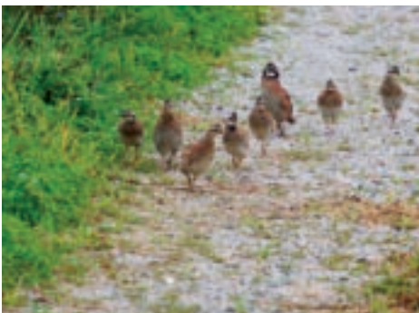
Covey of Bobwhite Quail