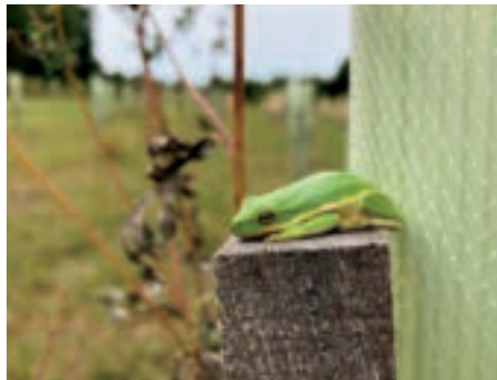
Green Tree Frog