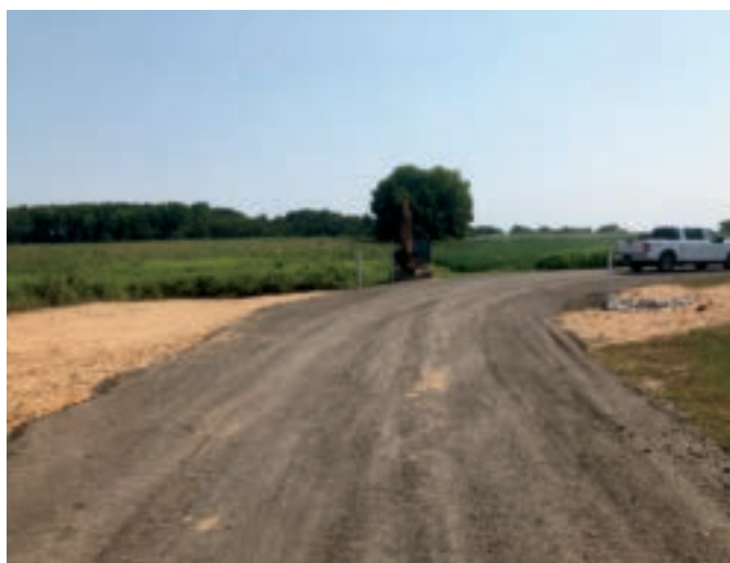
This new road is wider, better stabilized, improves water management and filtration, and provides better ingress/egress for large farm equipment. Great construction by Jeff Bartsch Trucking & Excavating Inc.!