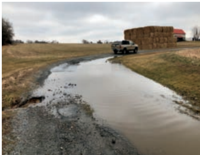
Before New Castle Conservation District's assistance, note the erosion on the left side of the road.

Knowing New Castle Conservation District could provide important insights into design and water management, we solicited their engineering input and construction recommendations for the road widening, turn reconstruction, field access, water management, and improvements to associated stormwater management. New Castle Conservation District delivered on all aspects through a cost-shared project agreement with DWL! We are grateful for this support from the District and a big thank you to Jeff Bartsch Trucking & Excavating Inc. for getting the job done!