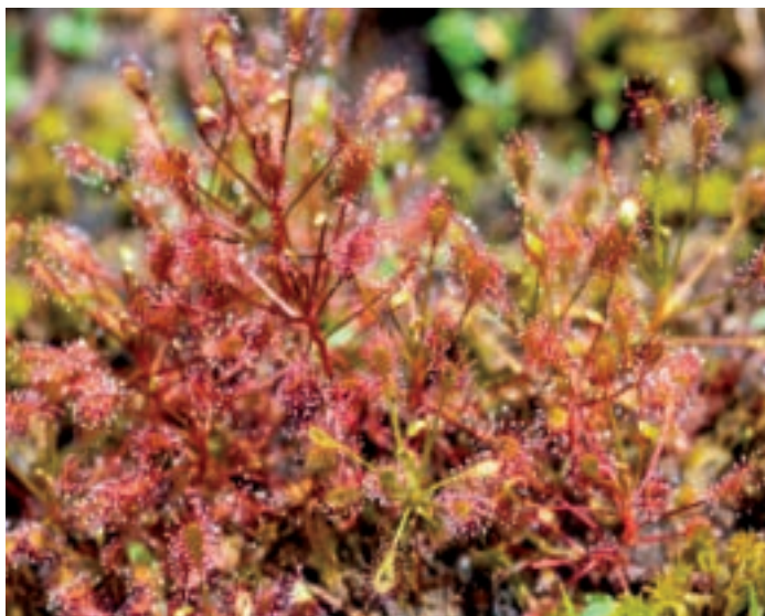
This Spoonleaf sundew at the Great Cypress Swamp thrives in DWL's 80-acre wetlands restoration site.

Together, DWL and WEA recognize and are learning even more about the local, regional, and even global importance of the Great Cypress Swamp and we are pleased to join forces to accelerate restoration of this vital ecosystem and advance and improve the longevity and resiliency of this Bald cypress/ Atlantic white-cedar forest restoration project.