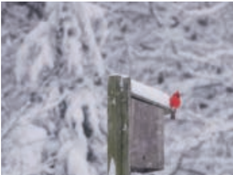
Cardinal on a Wood Duck Box