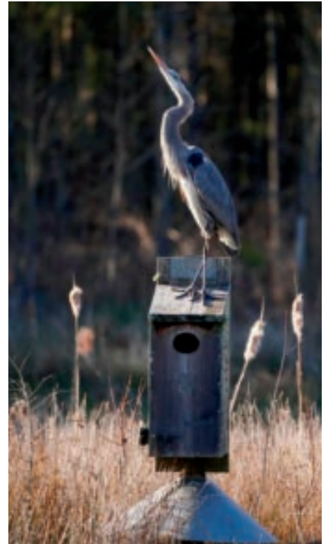
Blue Heron on a Wood Duck Box