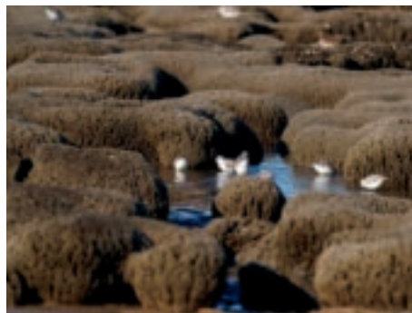
Sanderlings on Sabellaria Reef